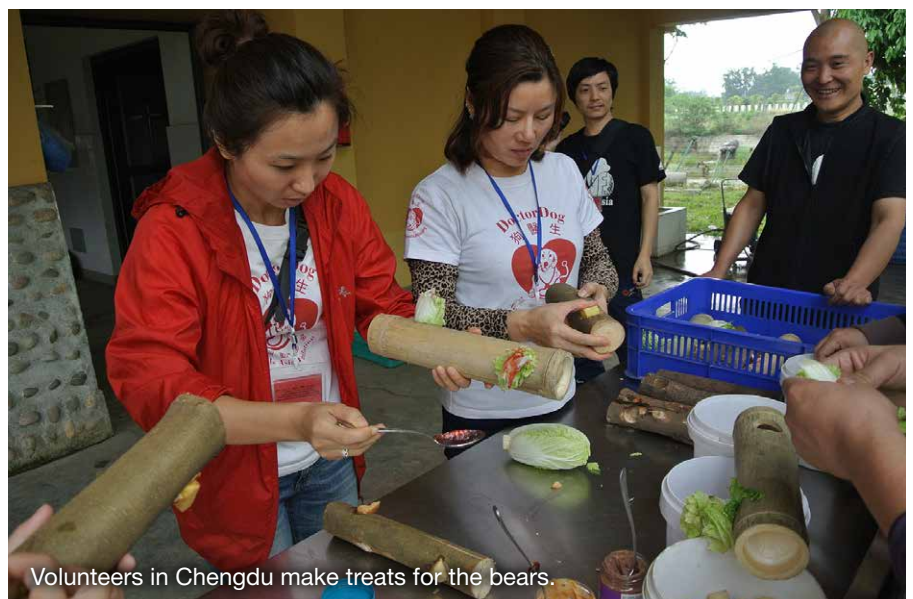
Volunteers in Chengdu make treats for the bears.

The second China Cat and Dog Welfare Programme – Volunteer Camp was held from April 20-23 and was held in appreciation of our volunteers' great support and to give them a better understanding of animal welfare. Besides listening to animal welfare lectures, volunteers at the "Chengdu Camp" visited our Moon Bear Rescue Centre in Chengdu and learned to prepare food for the bears. Volunteers at the Guangzhou-Shenzhen Camp visited SPCA facilities in Hong Kong.