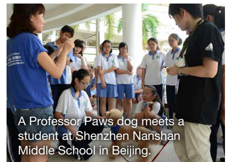
A Professor Paws dog meets a student at Shenzhen Nanshan Middle School in Beijing.

Shaonian Huanbao Pai (Young Environmentalists) is a public welfare association organised by ninth-grade students at Shenzhen Nanshan Middle School attached Beijing Normal University. The association started planning and implementing a "Be healthy. Say No to cat and dog meat" promotion in early 2013. Animals Asia has provided guidance and promotional materials for the student group since it was founded. The Young Environmentalists won first prize in the second Shenzhen Youngsters Public Practice Contest in November.