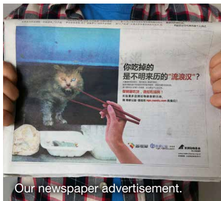
Our newspaper advertisement.

Over 300 posters with the same theme were put up in metro and bus stations, as well as elevators, in 16 cities in China, including Nanning, Shanghai, Guangzhou, Wuhan, Beijing, Shenzhen and Nanjing. They were also featured by several animal-welfare websites and leading newspapers like Taobao (a unit of the Alibaba group), Yibo and Nanfang Media outlets.