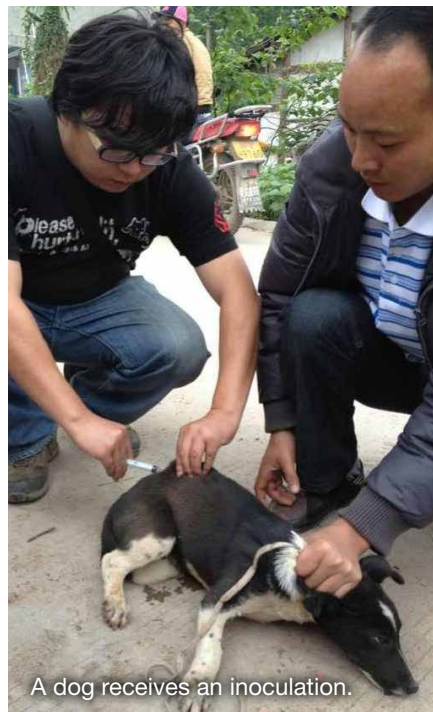
A dog receives an inoculation.