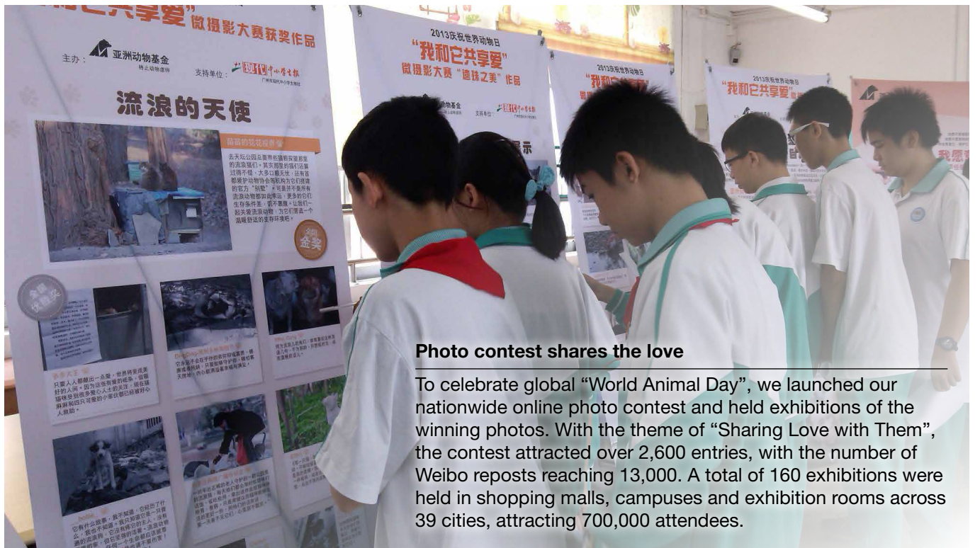
Photo contest shares the love

To celebrate global “World Animal Day”, we launched our nationwide online photo contest and held exhibitions of the winning photos. With the theme of “Sharing Love with Them”, the contest attracted over 2,600 entries, with the number of Weibo reposts reaching 13,000. A total of 160 exhibitions were held in shopping malls, campuses and exhibition rooms across 39 cities, attracting 700,000 attendees.