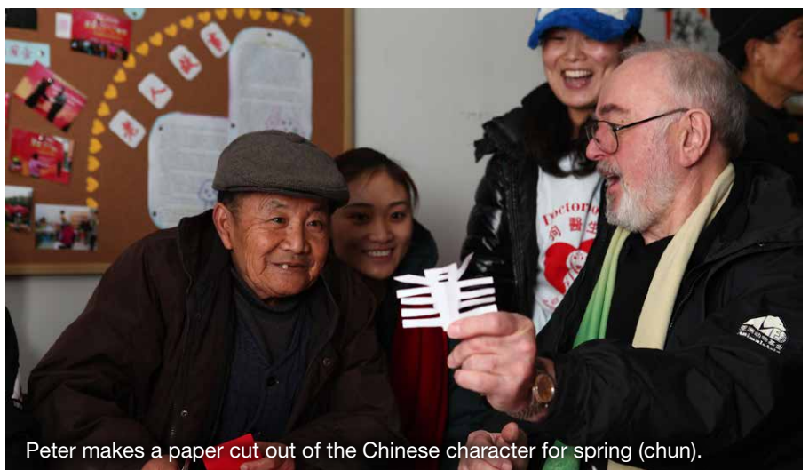
Peter makes a paper cut out of the Chinese character for spring (chun).