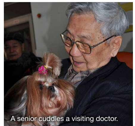
A senior cuddles a visiting doctor.

In 2013, for the first time we invited the public to take part in our China Dr Dog visits and we received support from corporate volunteers from companies such as Standard Chartered Bank, Bank of China, Tencent, Bayer and Qi Energy.