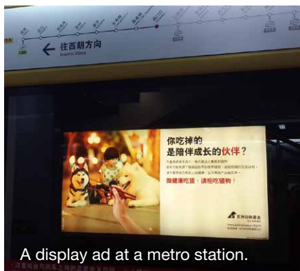
A display ad at a metro station.

Over 300 posters with the same theme were put up in metro and bus stations, as well as elevators, in 16 cities in China, including Nanning, Shanghai, Guangzhou, Wuhan, Beijing, Shenzhen and Nanjing. They were also featured by several animal-welfare websites and leading newspapers like Taobao (a unit of the Alibaba group), Yibo and Nanfang Media outlets.