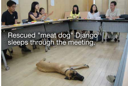
Rescued "meat dog" Django sleeps through the meeting.