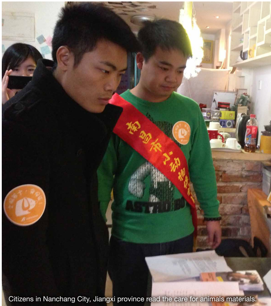
Citizens in Nanchang City, Jiangxi province read the care for animals materials.