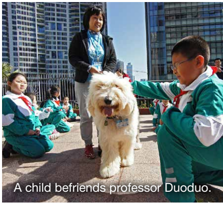
A child befriends professor Duoduo.

Three of Animals Asia's Professor Paws and police representatives from the Security Management team of Guangzhou Public Security Bureau visited Dong Feng Dong Lu Primary School to promote responsible dog ownership. The students learned about Guangzhou dog management regulations, how to care for dogs responsibly and how to get along with our canine friends through videos and interaction with our Professor Paws ambassadors.