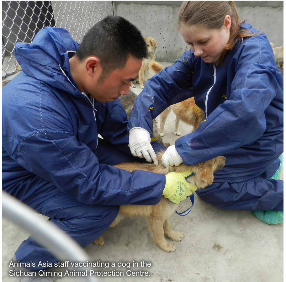
Animals Asia staff vaccinating a dog in the Sichuan Qiming Animal Protection Centre.

On March 2, a truck headed to Guangdong's Zhanjiang City, carrying caged dogs was reported and subsequently stopped by volunteers in Chongqing. Soon after, the dogs were confiscated by the local government. Seven hundred were temporarily housed by the Sichuan Qiming Animal Protection Centre. As most of the dogs were in bad health, they were taken to Qiming's new centre to be vaccinated. We wish to thank MSD which donated 1,000 doses of the Intervet vaccine.