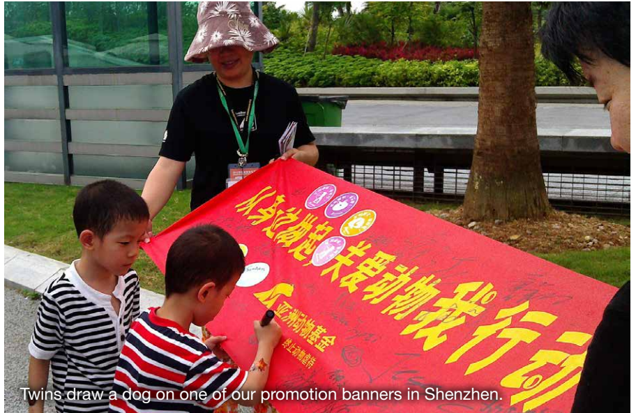
Twins draw a dog on one of our promotion banners in Shenzhen.