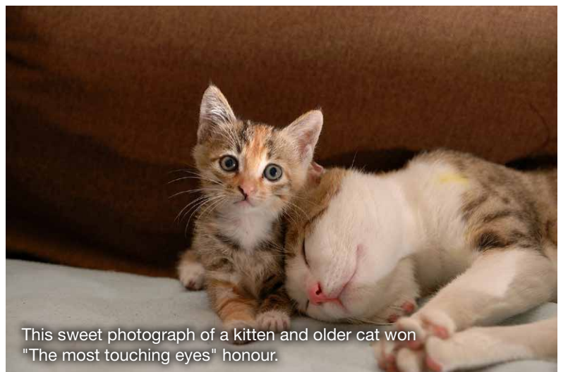
This sweet photograph of a kitten and older cat won “The most touching eyes” honour.