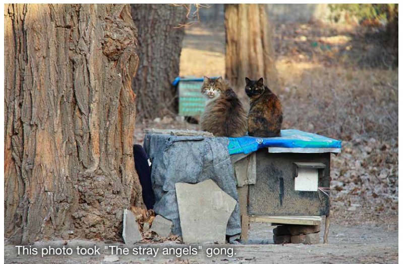
This photo took “The stray angels” gong.