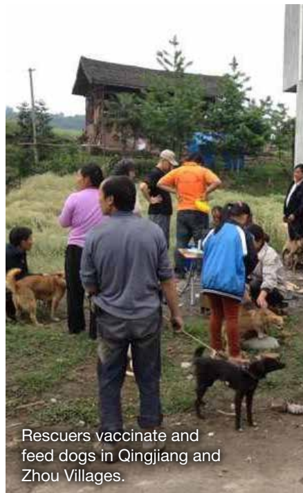
Rescuers vaccinate and feed dogs in Qingjiang and Zhou Villages.