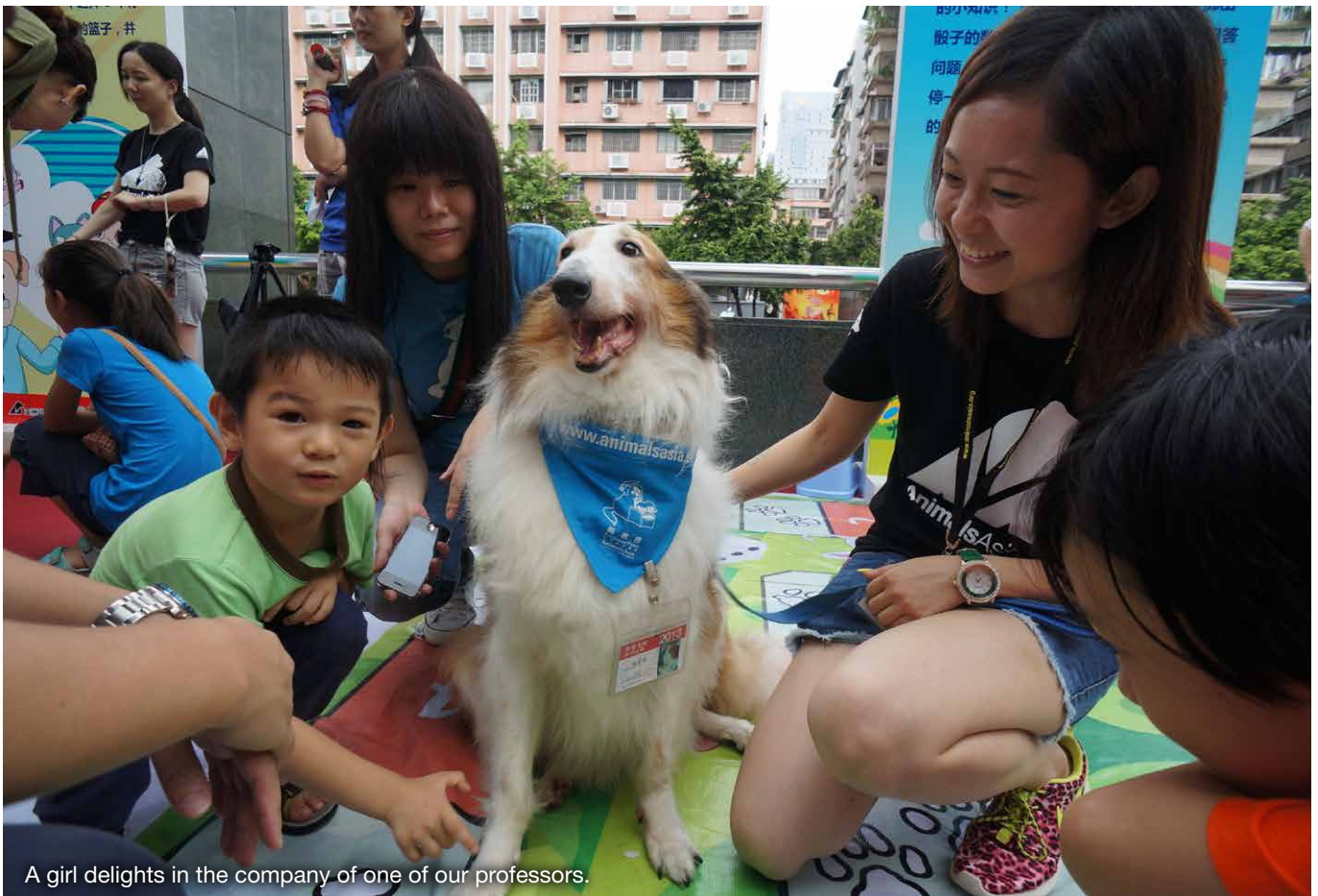
A girl delights in the company of one of our professors.