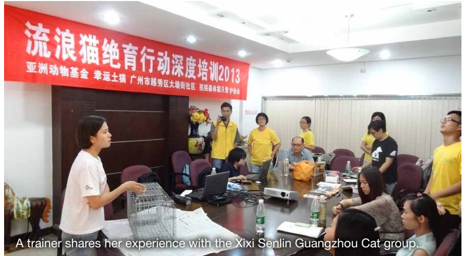
A trainer shares her experience with the Xixi Senlin Guangzhou Cat group.

After the success of Animals Asia's TNR (trap, neuter, release) training events in Zhangzhou and Tianjin in 2012, we extended the programme in 2013 and carried out comprehensive TNR training courses in Changsha, Guangzhou and Shijiazhuang. Staff from Beijing welfare group, Lucky Cats, spoke about various aspects of TNR with seminar attendees and participated in team-building exercises.