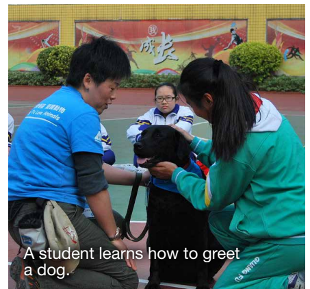
A student learns how to greet a dog.

Invited by the Guangzhou Youth Science and Technology Education Association and Hong Kong SPCA, the Guangzhou Professor Paws team launched a “Care for animals” course to over 200 students and teachers from 10 middle schools.