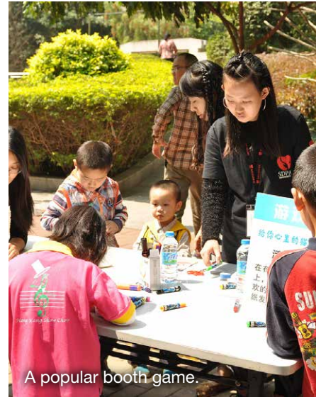
A popular booth game.