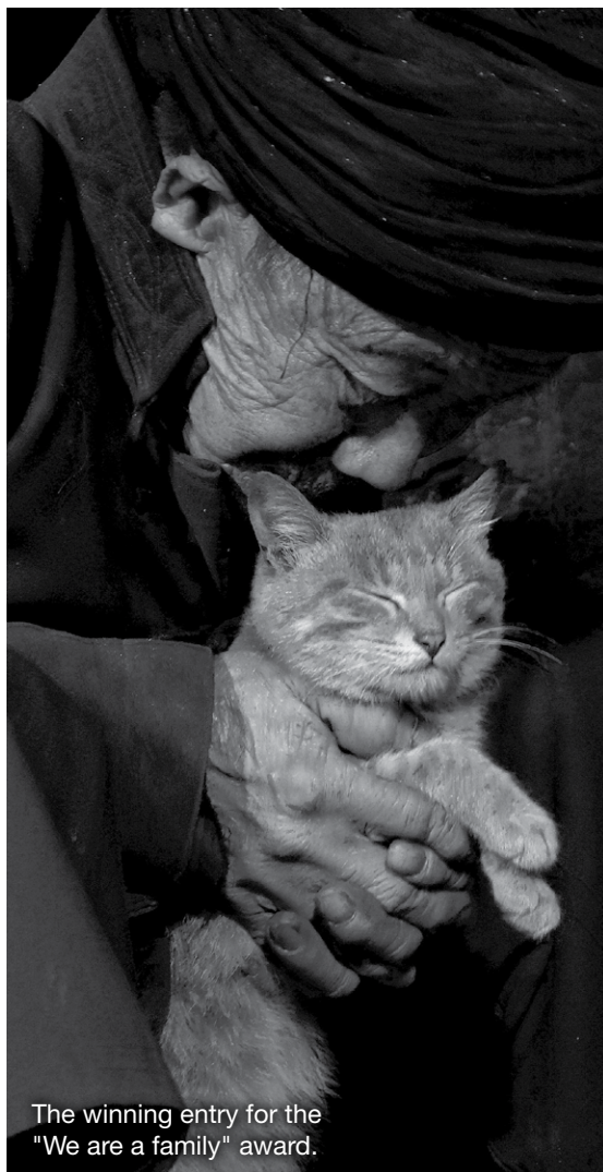
The winning entry for the “We are a family” award.

To celebrate global “World Animal Day”, we launched our nationwide online photo contest and held exhibitions of the winning photos. With the theme of “Sharing Love with Them”, the contest attracted over 2,600 entries, with the number of Weibo reposts reaching 13,000. A total of 160 exhibitions were held in shopping malls, campuses and exhibition rooms across 39 cities, attracting 700,000 attendees.