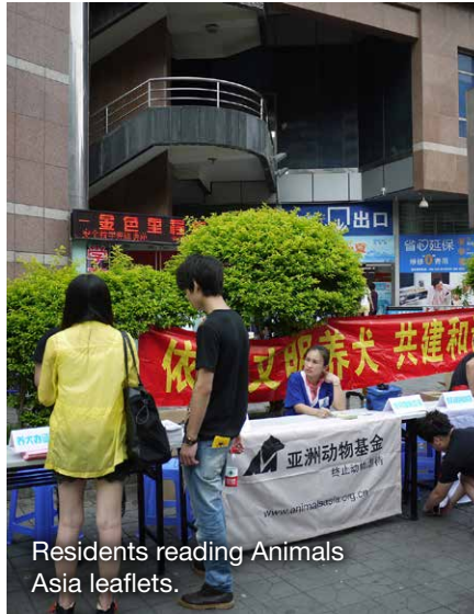
Residents reading Animals Asia leaflets.

The Management Office of Luohu District in Shenzhen joined Animals Asia and the Shenzhen Dog Protection Association in promoting responsible dog ownership to nine Luohu District communities. We provided dog ownership and veterinary consultations, distributed leaflets and offered educational booth games. Ten thousand leaflets on “How to get along with small animals” and “Basic care of dogs” were handed out.