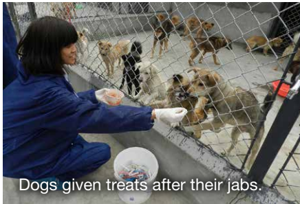
Dogs given treats after their jabs.