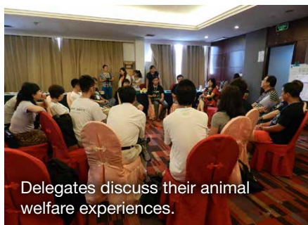
Delegates discuss their animal welfare experiences.

Over 170 delegates attended the Fourth China Companion Animal Symposium in Changsha, Hunan, hosted by Animals Asia, Humane Society International (HSI) and the Changsha Small Animal Protection Association. Representatives from around 100 NGOs, including both grassroots Chinese organisations and international charities, attended.