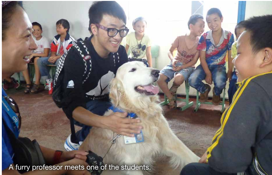
A furry professor meets one of the students.