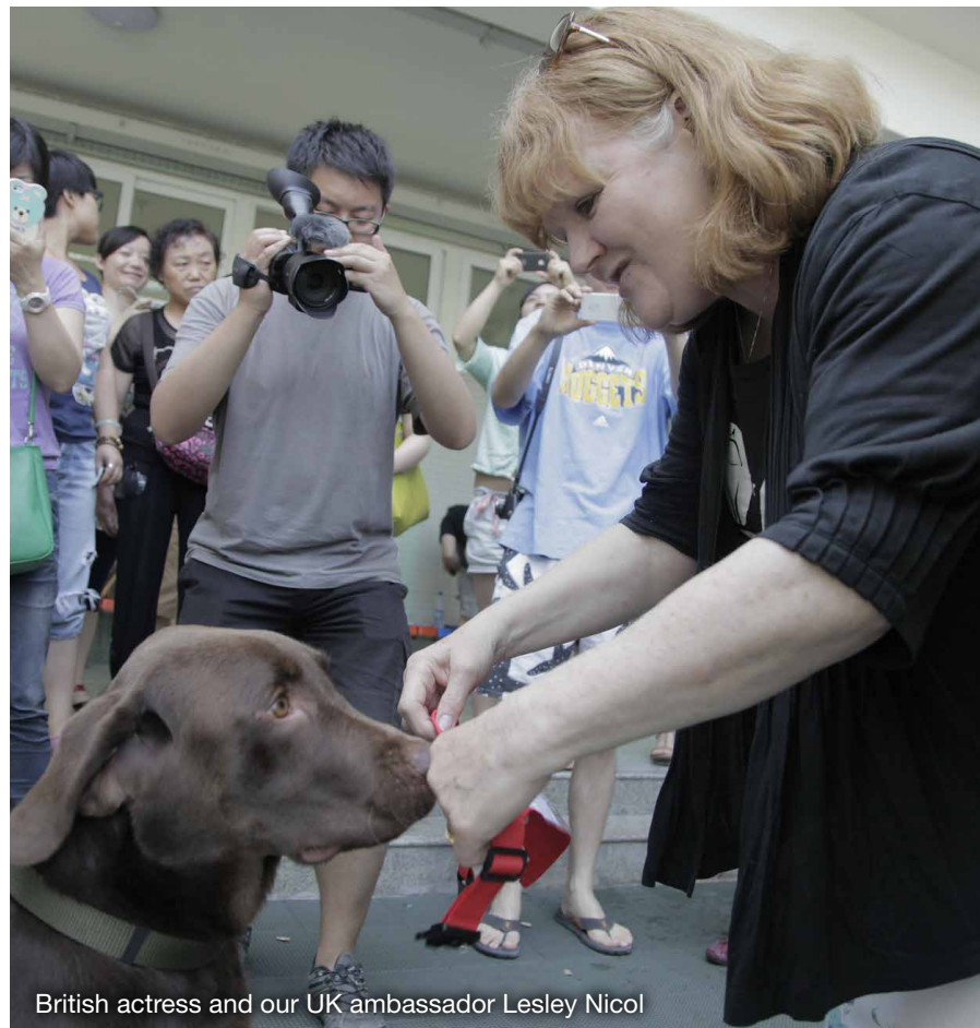
British actress and our UK ambassador Lesley Nicol