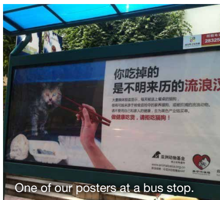
One of our posters at a bus stop.

We are grateful to have received so much help in informing the public about the hidden dangers of eating dog and cat meat, and how to avoid getting caught up in the illegal trade. The advertisement campaign got over 10,000,000 commuters since it was launched in May.