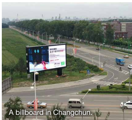
A billboard in Changchun.

The three posters (left) were put on Weibo (China's version of Twitter) in May 2013 and so far have had over 20,000 reposts and supportive comments, including some from celebrities like Karen Mok, Hu Ge, Qi Qin and Lu Xu.