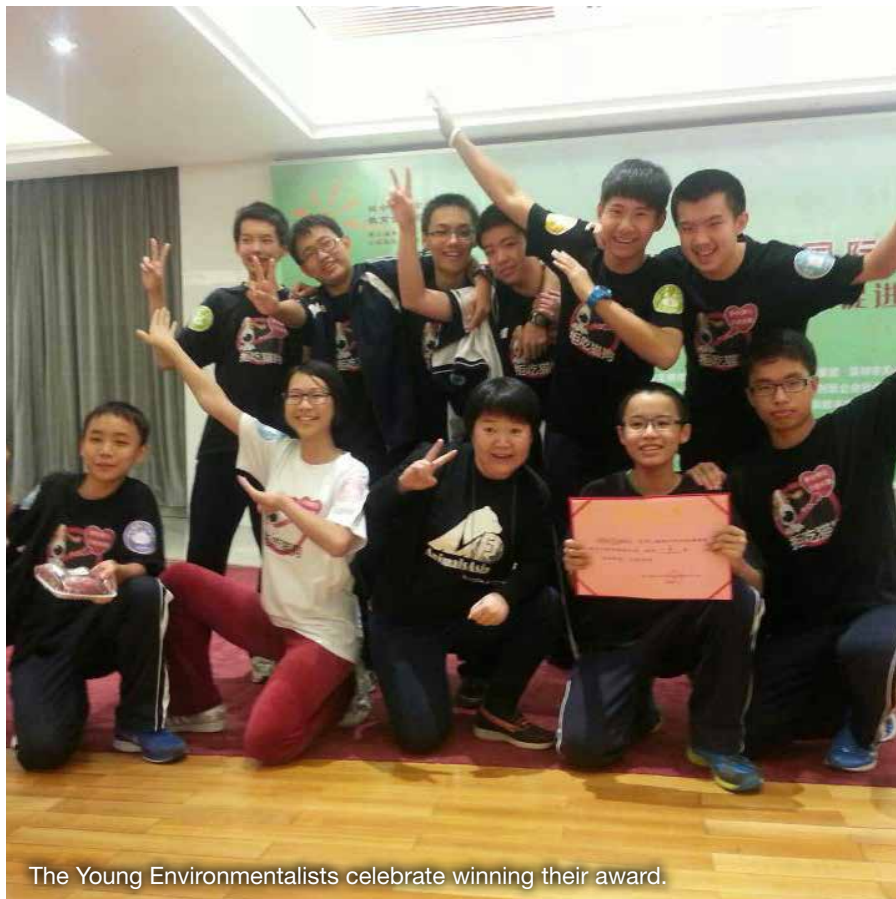
The Young Environmentalists celebrate winning their award.