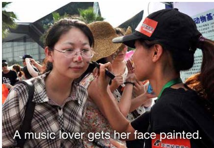
A music lover gets her face painted.

Animals Asia attended the 20th Midi Music Festival in Shenzhen that combined music with animal-welfare education. Our educational activities were enthusiastically supported by many of the music lovers in attendance.