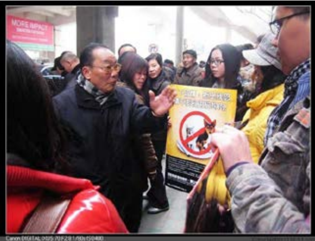
Xi An Xi Jing Companion Animal Rescue Center distributed leaflets on the street.