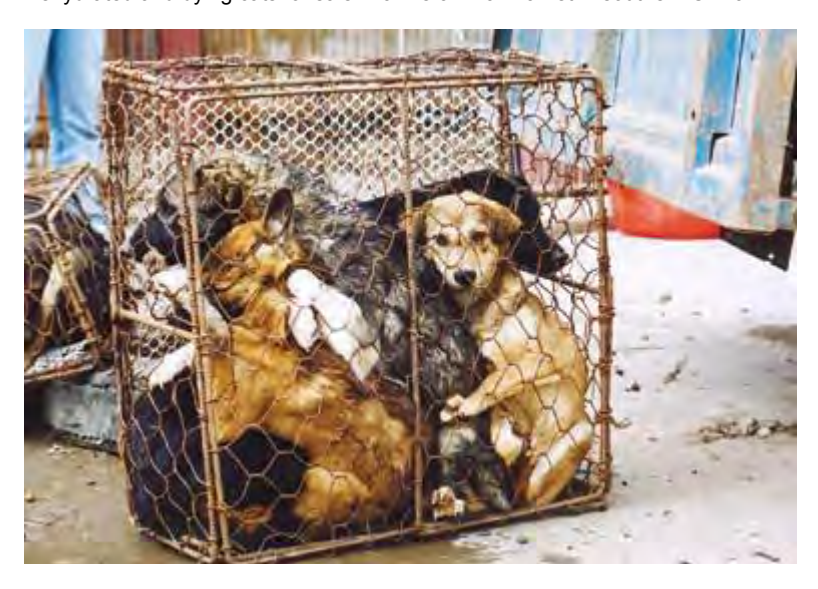
Dogs arrive after a nightmare three-day journey by truck.