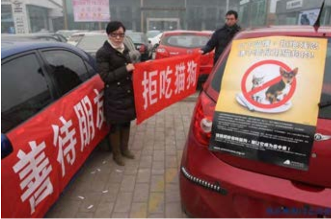
Guang Yuan Small Animal Protection Center held a road show in the downtown area of the city.