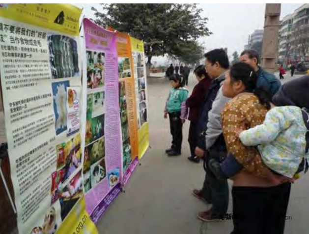
Wuhan Stray Dog Rescue Center held a road show in the downtown area, walking through the city with posters advertising that dogs and cats are friends, not food.