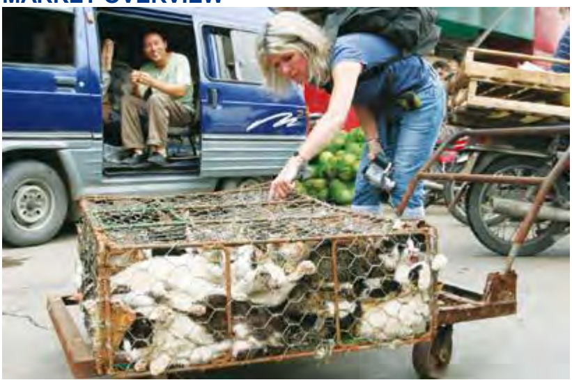
Dehydrated and dying cats for sale in a live-animal market in southern China.