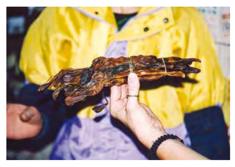
Dried dog penises in a traditional medicine market in China.

In China, dog meat is consumed as a tonic food, providing warmth in the winter months, as well as helping cure fatigue, low back pain, poor memory and slow digestion in older men. (Interestingly and paradoxically, in the same continent, dog meat is eaten in South Korea during the summer months to cool the body down.) Dog skin and gallstones are used to invigorate the body or heal sickness, dog penis and testes are used for impotence and lowered sex drive, and dog kidney is consumed to cure impotence and premature ejaculation. The bones of dogs are sometimes used as an alternative to tiger bone to treat rheumatism. At least one company in Jiangsu Province is attempting to market "dog brain powder" as a treatment for various neurological disorders.