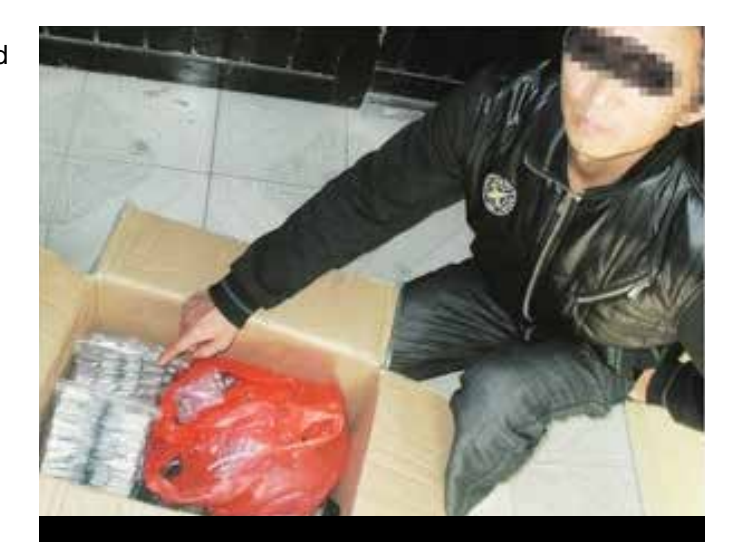
Criminal suspect identifies the poison darts.

On Nov.15, 2013, special investigation team policemen rushed into this den, finding that the house was a hive of activity, pools were all over the yard, on the pools there piled up dogs whose hairs had been all pluck out, a hair removal machine was running, the ground was stained with blood, and the smell was nauseating.